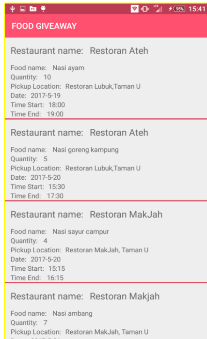
Figure 3 Post student interface