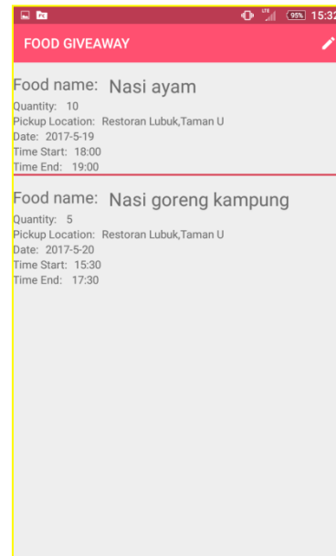
Figure 2 Post restaurant interface

Figure 1 shows the interface where the user restaurant able to create new post. The post that have been created by user restaurant will be show as Figure 2. Figure 2 shows the interface that have been created by restaurant.