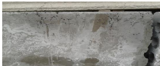
Figure 5: Pore defect

Based on the field observation, the work process of slide former machine always runs smoothly. It is supported by the regular maintenance on a weekly basis and inspection when operating the machine by the operator and technicians from maintenance division. If there is a failure of slide former machine, then it cannot be in operation and it will obstruct the production process.