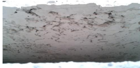
Figure 8: Porous Defect

In the lifting process of HCS, there may be porous defect in concrete if it hit by machine (Figure 8). Non severe porous defect can be repaired by patching.