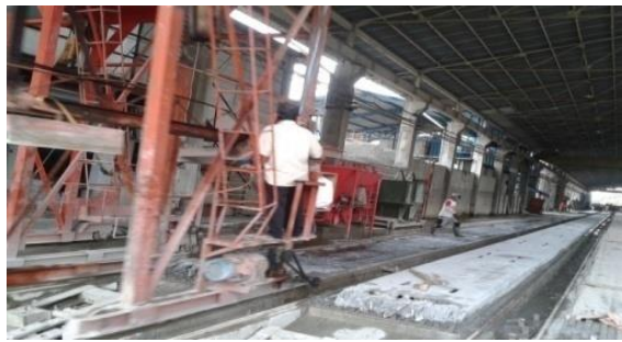
Figure 6: Lifter operator did not use helmet and safety shoes

The operator also did not use safety shoes, but a sandal made of rubber (Figure 6). This is quite dangerous because the operator can just slip or hit by the machine components when operating the lifter. Based on the interview with the Chief of the General Division, work accident due to fall off from lifter can seriously harm the operator and may cause fatality.