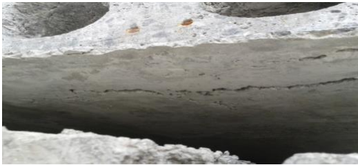
Figure 7: Crack in HCS