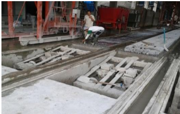
Figure 2: Operator cleaned the mould without using gloves

After the manufacturing process of HCS, the operator cleaned again the mold by removing 50-cm concrete remnants from the end of the lane by using a hoist. This process is also assisted by an operator who directed the concrete remnants to the disposal site. Based on the field observation the operator did not use safety devices such as helmet and gloves to protect his body from the wire that comes from the concrete (Figure 3). If this thing happened, this can cause injury to the hand, head and other body parts.