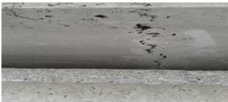
Figure 4: Tearing defect

Pore defect is a concrete defect in the shape of small holes in the pores of the concrete (Figure 5). This pore defect has no effect on the structure of HCS, only affecting the aesthetic factor. This pore defect can be repaired by patching.