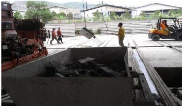
Figure 3: Operator directed the concrete remnants without using safety devices

From the analysis above, risk factors in the process of mould cleaning are: