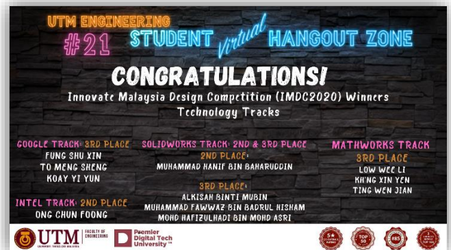
Technology Tracks Winners, placed 2 nd and 3 rd