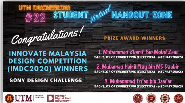
Technology Tracks: Sony Design Challenge winners