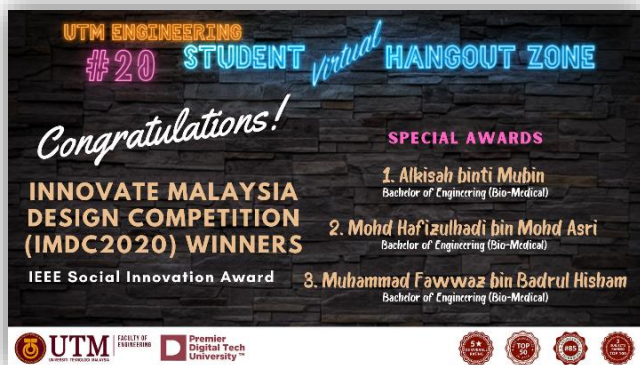
Special Awards: IEEE Social Innovation Award.